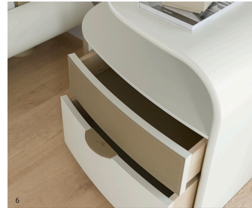
4.5.6. Novecento europeo chest of drawers and bedside table in open-pore signal white lacquered ash and beige color leather collection.

B ed - Ricordo is a bed that fully fits into Fazzini design philosophy. The sumptuous rounded solid wood bed frame continues along the entire perimeter with 45 degrees joints. This allows the bed to be positioned even in the center of the room, making it the main character of the sleeping area. The two soft cushions that make up the headboard and the solid wood feet can be made in all the finishes of the collection.