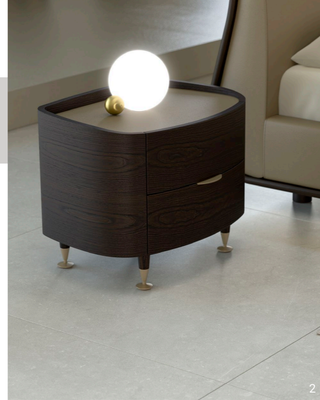
1.2. Ginevra chest of drawers and bedside table in open pore stained coffee ash. Top and handles in mink leather. Feet in coffee-stained ash with base in mink lacquered steel. 3. Jolly Prestige wardrobe in open pore stained coffee ash and slats in mink leather. 4. Fred bed in open pore stained coffee ash and mink leather