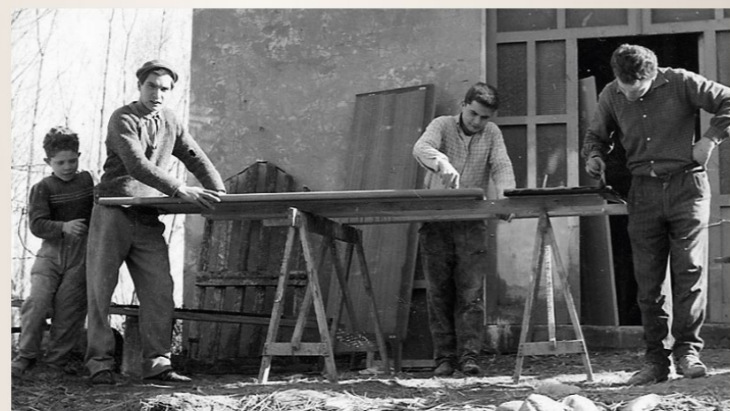
si fatica ma con passione