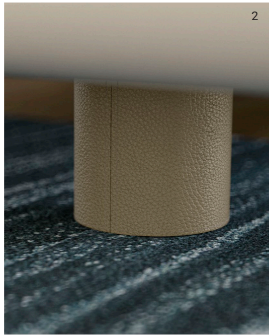
1. Ricordo bed in open pore signal white lacquered ash. Cushions and feet in leather collection beige leather. 2. Foot bed detail covered in leather