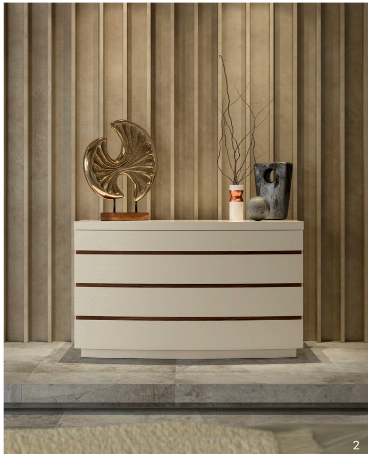
1. Open-pore magnolia lacquered ash Lekurve bed. Headboard in canaletto walnut. 2.3. Oriente chest of drawers and bedside table in open pore magnolia lacquered ash.

Lekurve is a modern bed, with refined and essential lines. The plywood headboard includes an insert available in ash wood or coated with the countless trendy materials from the catalog. The prominent solid wood bed frame contributes to the aesthetic balance of one of the timeless products of the Fazzini collection.