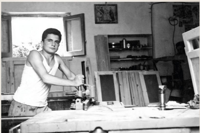
adesso non mi distrarre